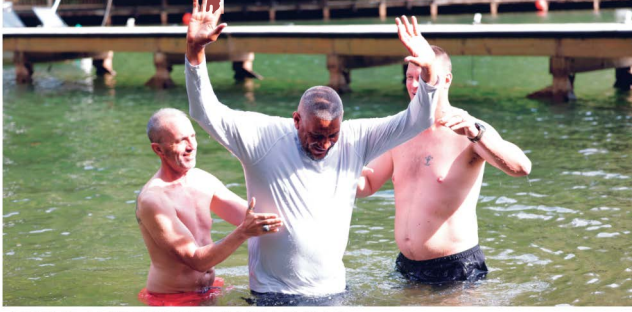
ABOVE: WARRIORS ARE BAPTIZED

Yet, in faith and the Christian walk, many never practice full obedience to the guidance of Scripture. They might say the "right things" or look the "right way," but until you spend time with them, you see only the image they display. This is actually a crisis in the Body of Christ.