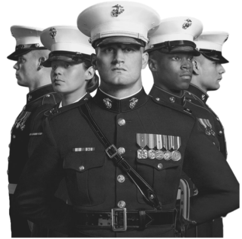
MARINES THE FEW. THE PROUD.

That pride drives many to serve in unique ways and make great sacrifices in an attempt to prove that they are "the best."